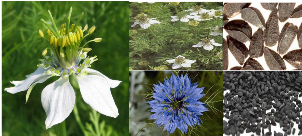
Figure 1: Nigella sativa (B. whole plant, A, D. flowers and C, E. seeds) adopted from internet.

When the capsule has developed, it releases up and the seeds inside are opened to the air, turning dark in color. The seeds have a strong pungent flavor and are triangular in shape (Chevallier, 1996).